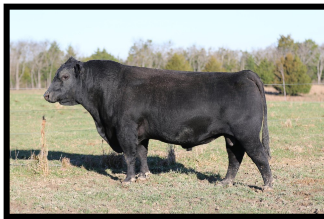
Triple E Farms Chiangus Bull

DOB: 02-19-16 BW: 80 Reg. No: 390730 Tattoo: 819D % Chianina: 8.55 Scrotal: 44