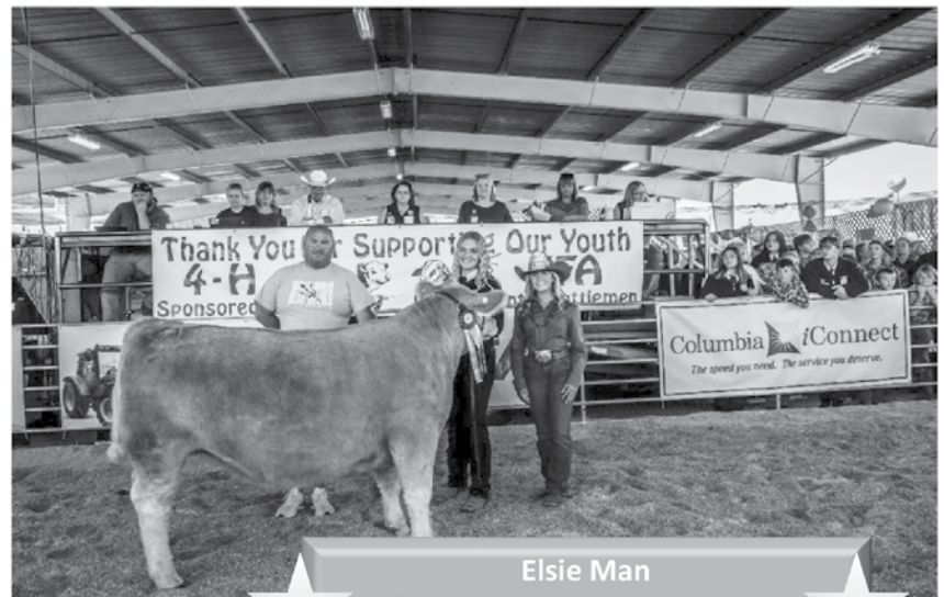
Elsie Man Reserve Grand Champion Steer Five Star Cellars