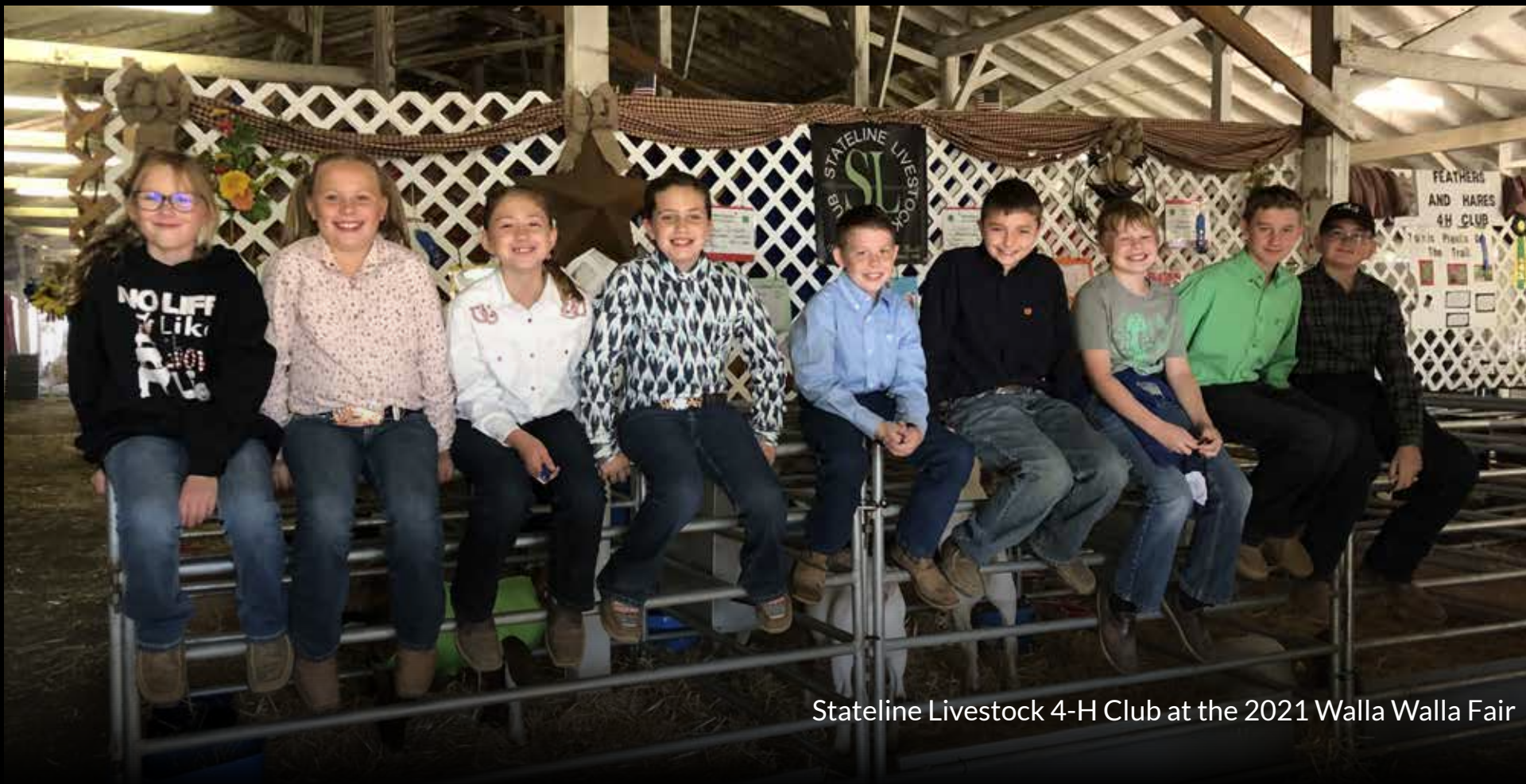
Stateline Livestock 4-H Club at the 2021 Walla Walla Fair

Personal | Home | Business | Ag Banking & Lending