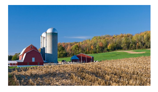
Do your students know where their food comes from?