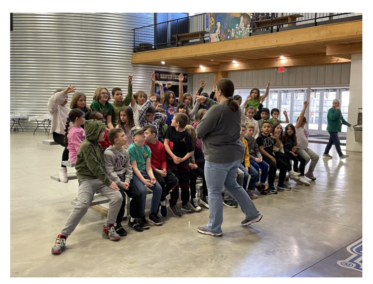
Or the important role that agriculture plays in their daily lives?