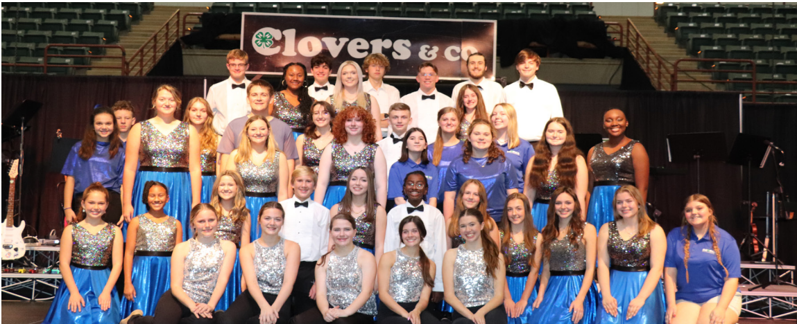
Clovers & Company at the 2022 Georgia National Fair

Clovers and Company represents the best performing talent in 4-H. Clovers members are selected through auditions annually. All 4-H'ers, age 9-19, are eligible. The group performs throughout Georgia and is nationally acclaimed, having performed from Chicago to Florida, and from Washington, D.C. to Alabama. The show is 45 minutes long and features singers, dancers, and a live band.