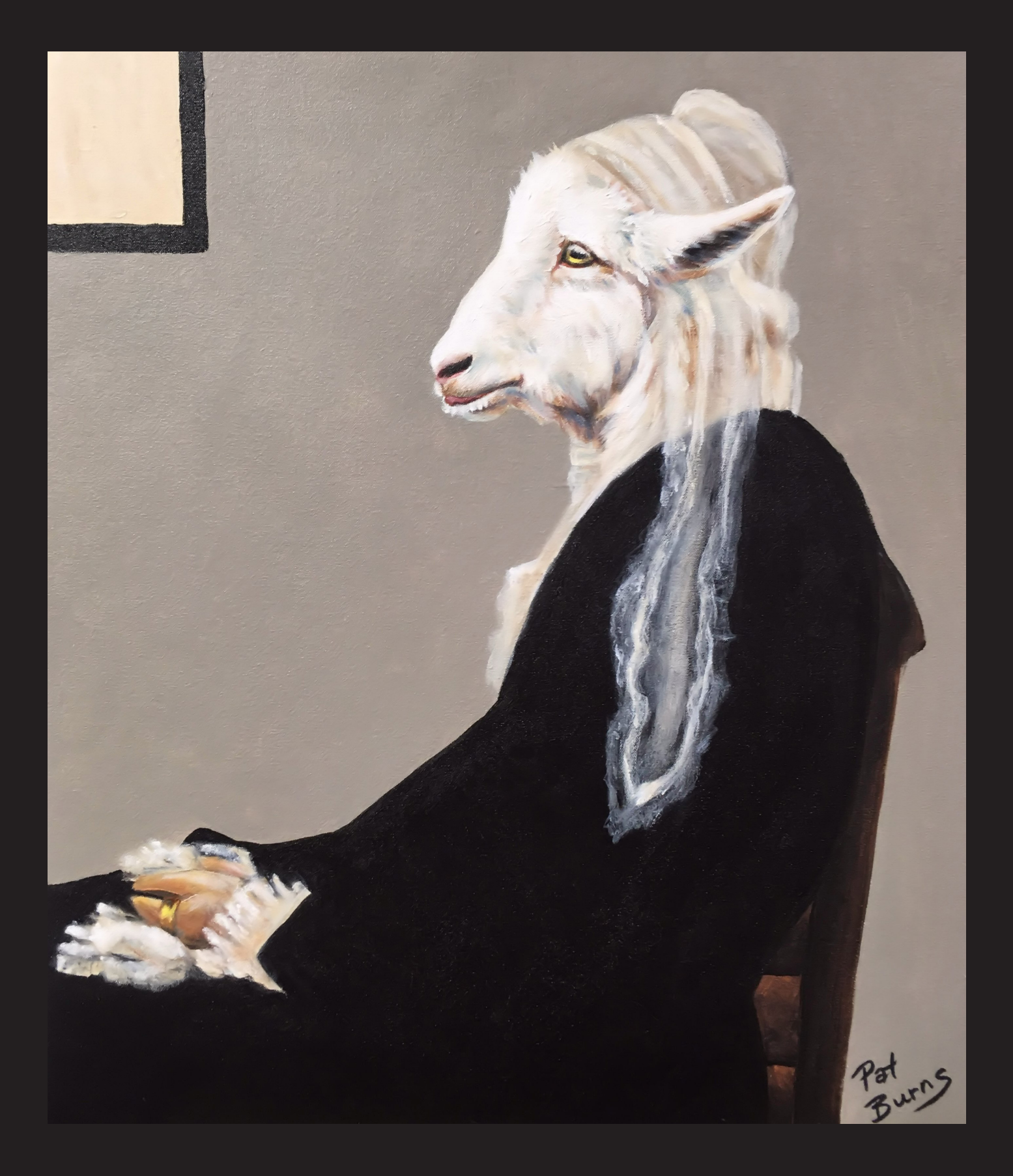
2024 GEORGIA NATIONAL FAIR FINE ART ENTRY DEADLINE AUGUST 8