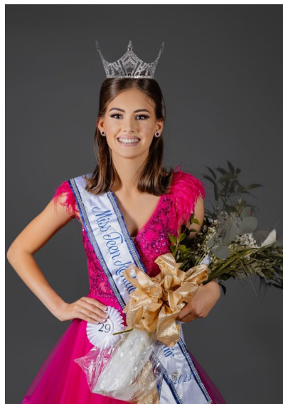
2023 Miss Teen Kentucky County Fair

(Special Notes: It's always a good idea to check the KAFHS website. Fairs must pay dues and fees for the upcoming year before contestants will be allowed to appear in January. Please check to see that all fees and dues are paid.)