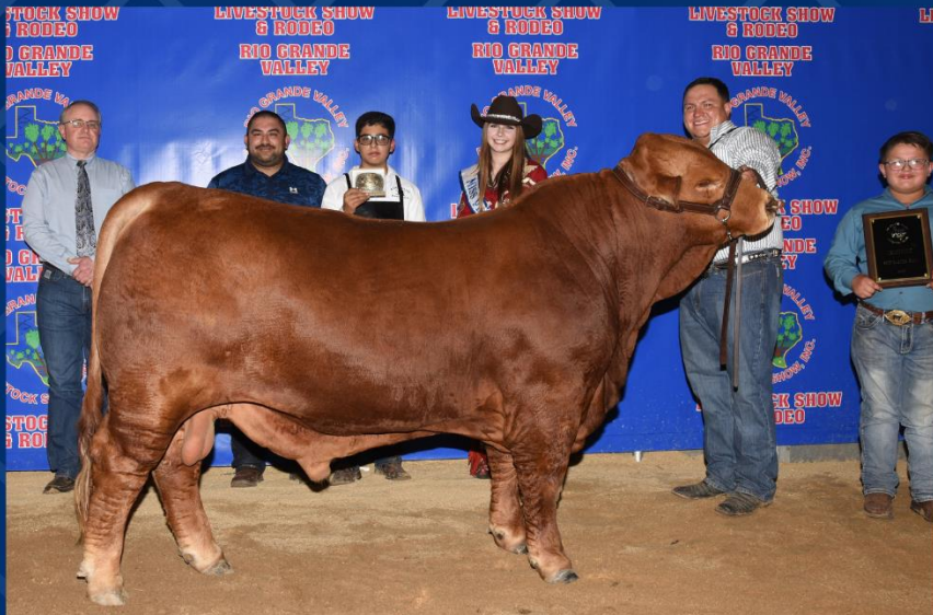
2023 CHAMPION BEEFMASTER BULL AMBER ROBLES SOMERSET FFA