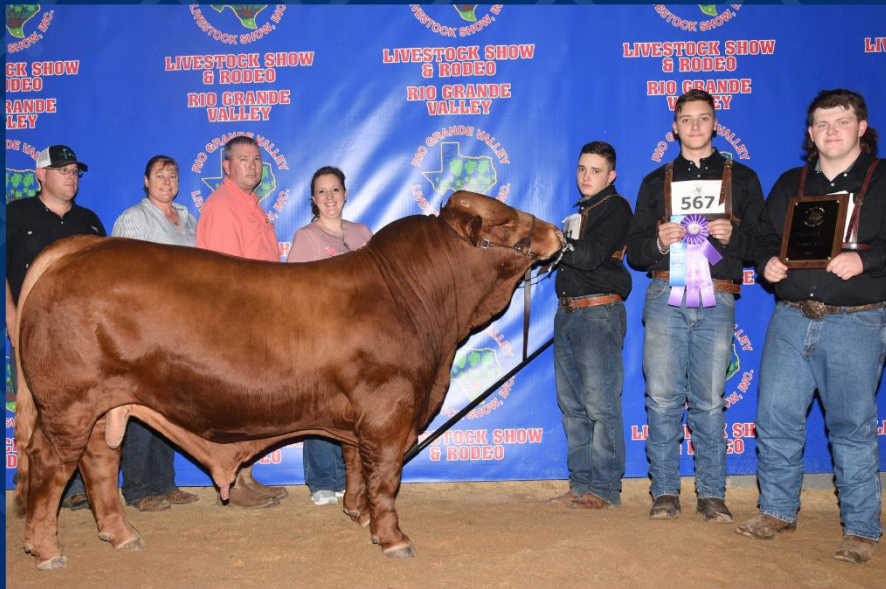
2023 CHAMPION SIMBRAH BULL POOL FARMS