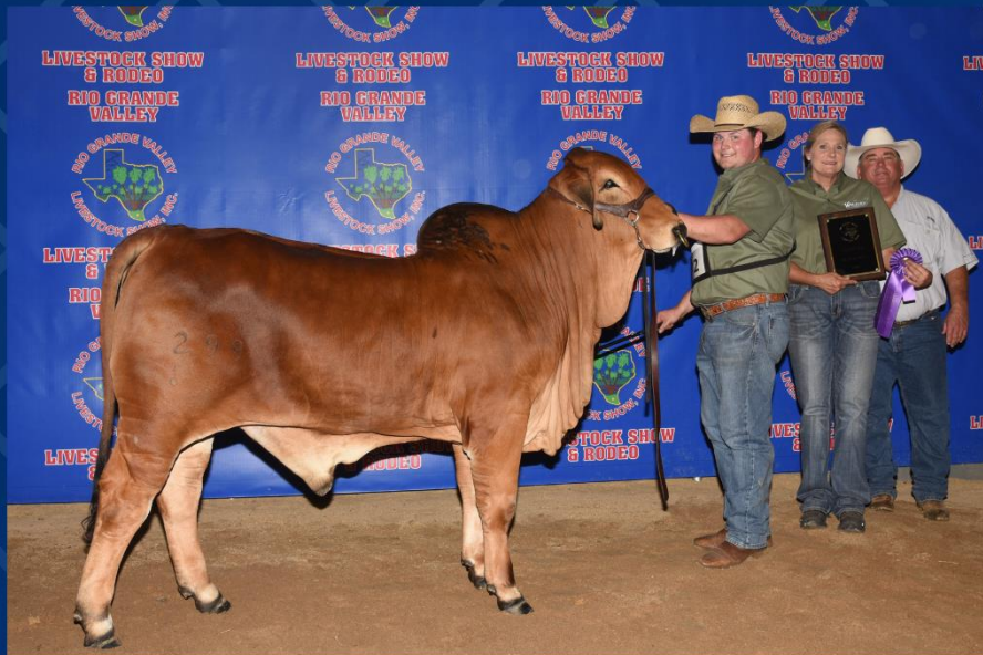
2023 CHAMPION BRAHMAN BULL - RED WALTERS LIVESTOCK