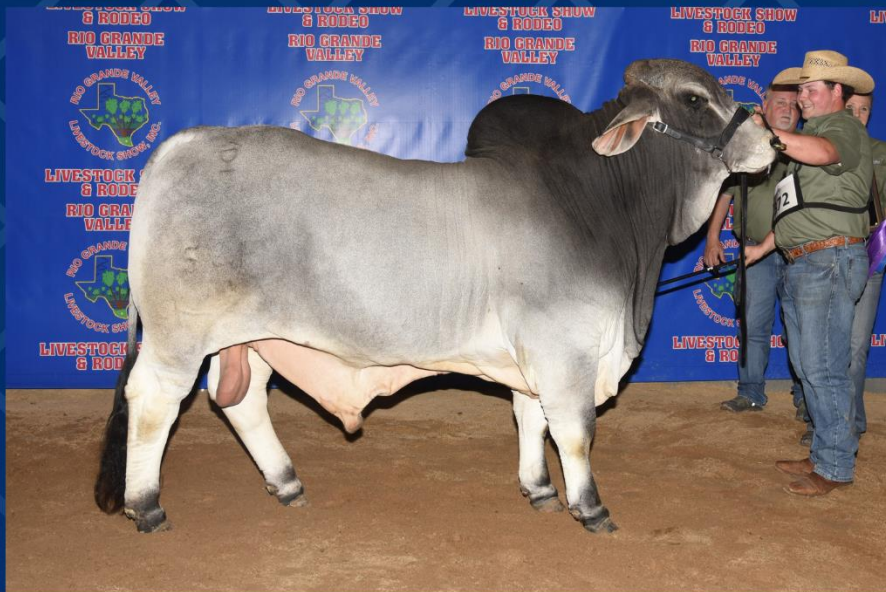
2023 CHAMPION BRAHMAN BULL - GREY WALTERS LIVESTOCK