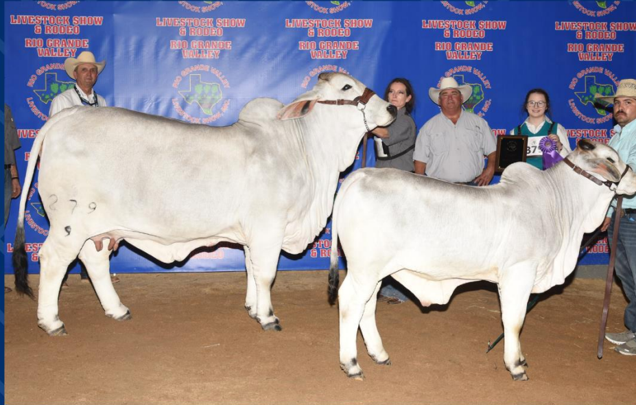
2023 CHAMPION BRAHMAN FEMALE - GREY WALTERS LIVESTOCK