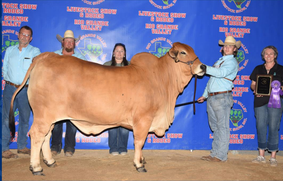
2023 CHAMPION BRAHMAN FEMALE - RED SIMPSON BRAHMAN