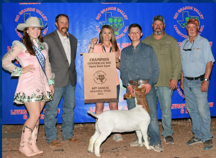
2023 CHAMPION COMMERCIAL DOE ROCKIN' ROBBINS SHOW GOATS