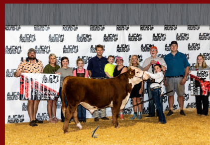
2023 Supreme Champion Bull Brooklyn Price