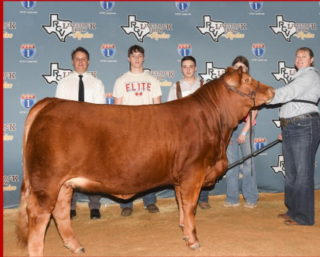
2024 Champion ARB Female Bar - P - Bar Cattle, Co.