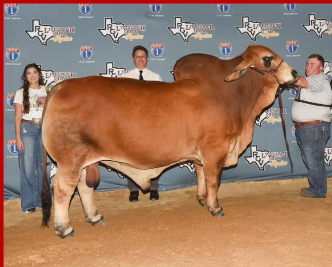
2024 Champion Brahman Bull - Red Circle T Cattle, Co., LLC