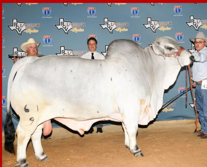
2024 Champion Brahman Bull - Grey Walters Livestock