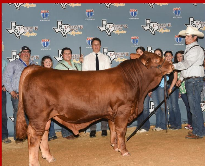
2024 Champion Simbrah Bull La Muneca Cattle, Co.