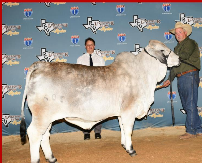
2024 Champion Brahman Female - Grey V8 Cattle, Co.