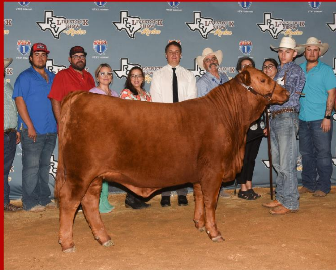
2024 Champion Red Brangus Female G Reynolds Cattle