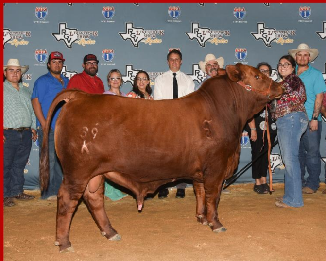
2024 Champion Red Brangus Bull G Reynolds Cattle