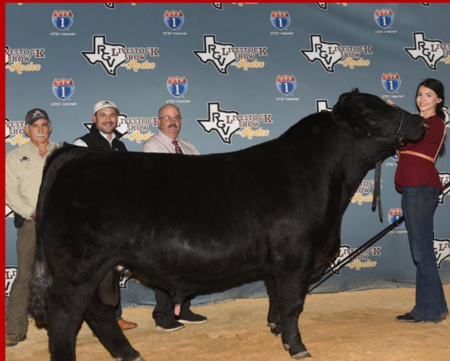
2024 Champion AOB Bull Dominguez Show Cattle