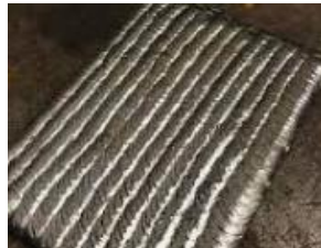
Pad Weld (pictured to the right)

All other welds and joints as shown in diagram below