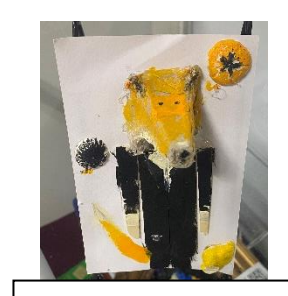
Recycled Craft by London Box (Youth 5-12)