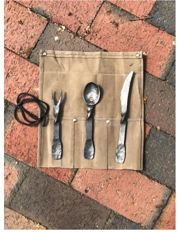
Page 5 of 5