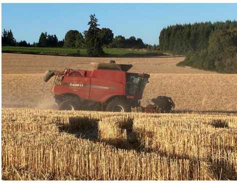
Soft white winter wheat in Washington County on July 23, 2024.