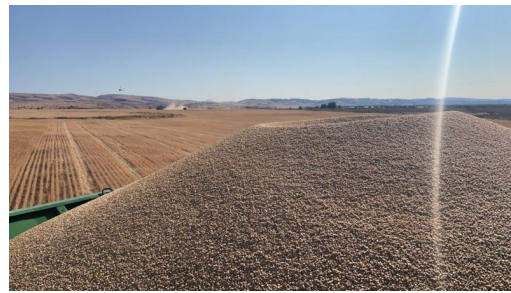
Soft white winter wheat in Wasco County on July 31, 2024.