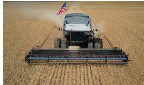
Soft white winter wheat in Sherman County on July 20, 2024.