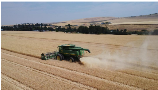
Soft white winter wheat in Umatilla County on August 5, 2024.