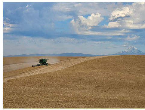
Soft white winter wheat in Wasco County on July 17, 2024.