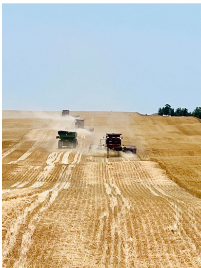
Soft white winter wheat in Sherman County on July 30, 2024.