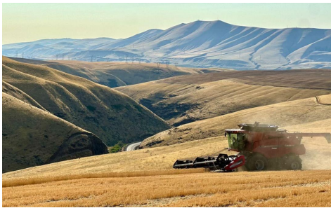
Soft white winter wheat in Sherman County on July 30, 2024.

The first weekly crop quality report is now available, but is based on a very limited number of samples so should not yet be used to assess the full crop quality. Representative data on the Pacific Northwest wheat crop is collected during harvest each year, with samples consistently analyzed by the Wheat Marketing Center for the soft white wheat crop.