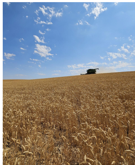
Soft white winter wheat in Wasco County on August 5, 2024.