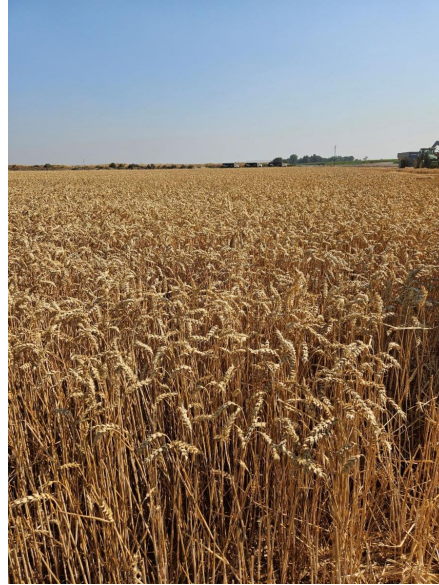
Soft white winter wheat in Malheur County on July 31, 2024.