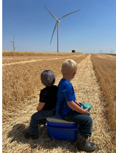
Soft white winter wheat in Sherman County on August 13, 2024.