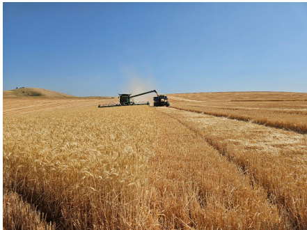
Soft white winter wheat in Umatilla County on August 14, 2024.