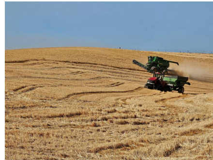
Soft white winter wheat in Wasco County on August 6, 2024.