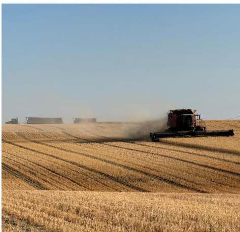
Sherman County on August 13, 2024.