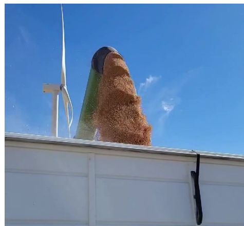
Morrow County on August 13, 2024.