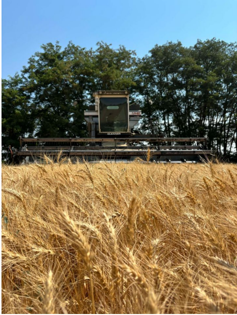
Soft white winter wheat in Umatilla County on August 12, 2024.