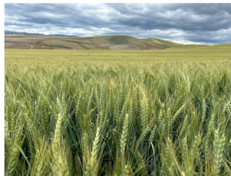
Soft white winter wheat in Umatilla County on June 17, 2024.