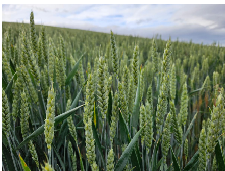
Soft white winter wheat in Wasco County on June 3, 2024.