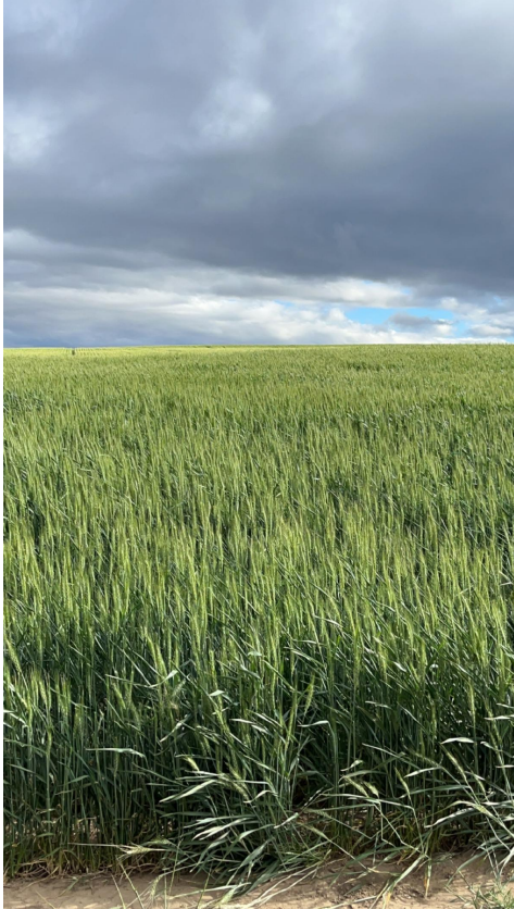
Soft white winter wheat in Sherman County on June 4, 2024.