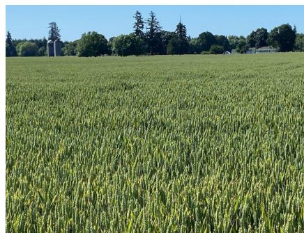
Soft white winter wheat in Benton County on June 6, 2024.