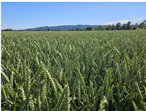
Soft white winter wheat in Washington County on June 12, 2024.