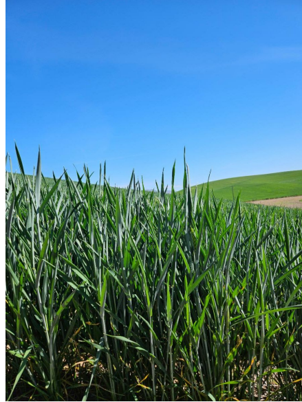
Soft white winter wheat in Wasco County on May 14, 2024.