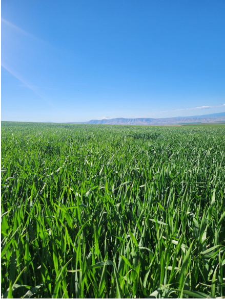
Soft white winter wheat in Sherman County on May 10, 2024.