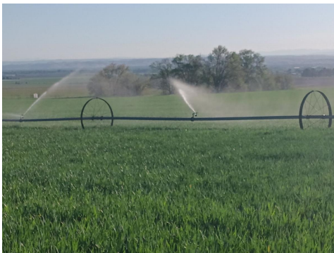
Irrigated wheat in Malheur County on May 14, 2024.