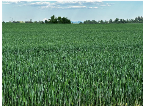
Soft white winter wheat in Washington County on May 11, 2024.