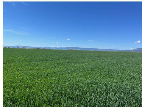
Soft white winter wheat in Union County on May 14, 2024.