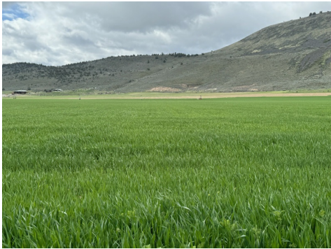
Hard Red Winter wheat in Klamath County on April 29, 2024.

Early rains in May further supported the crop development, followed by warmer weather. Thus far, there has been limited disease pressure. In some areas of the state, wheat is already headed.