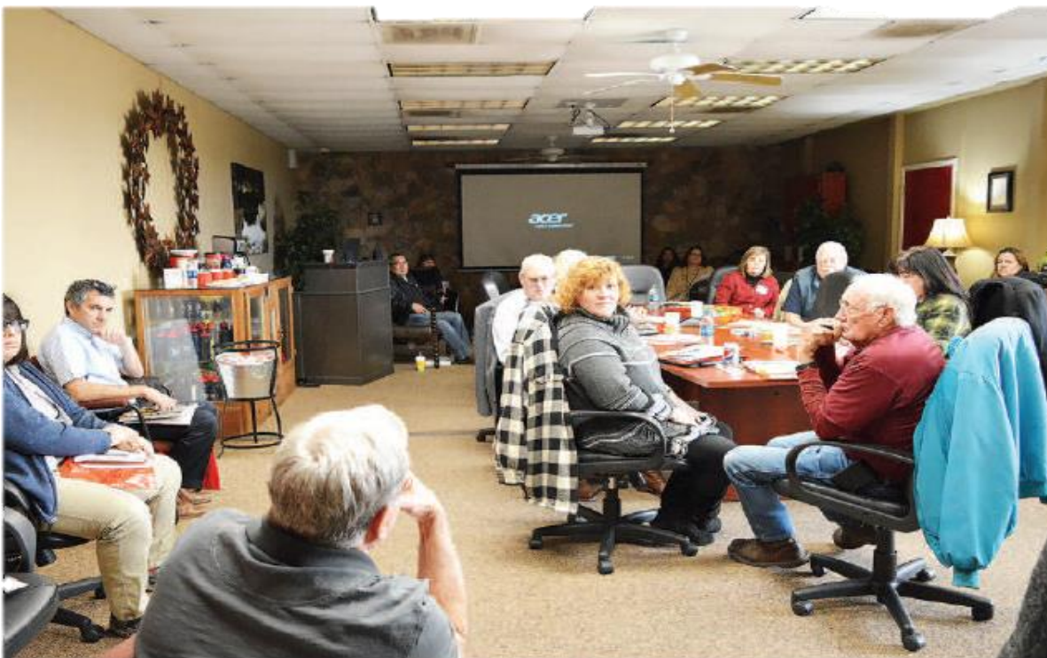
Visitor's Bureau and Chamber of Commerce Leaders from Del-Rio, Sanderson, Uvalde and Bracketville met Wednesday afternoon at the Del-Rio Chamber of Commerce.

A board of trustees-appointed selection committee will review the submissions and