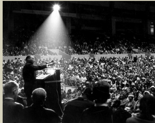
An intercultural celebration of the inspiring work of Dr. Martin Luther King Jr. presented by the Cow Palace

https://www.bates.edu/news/2015/01/15/photographing-mlk-in-1964-george-conklin-53-focused-on-the-final-frames/