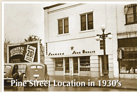
Pine Street Location in 1930's