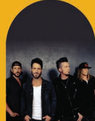
PARMALEE PARTY IN THE DIRT