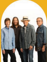
SAWYER BROWN DANCIN' IN THE DIRT