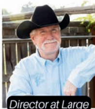
Director at Large