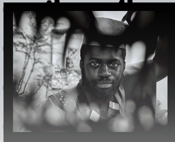
Add description here