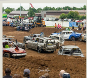
Crash Crazy Demo