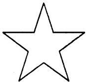
United States Flag