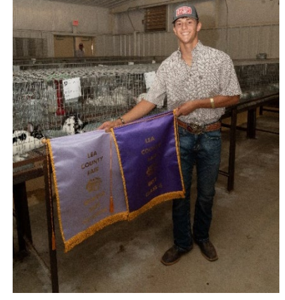
2023 Lea County Fair Junior Livestock Department