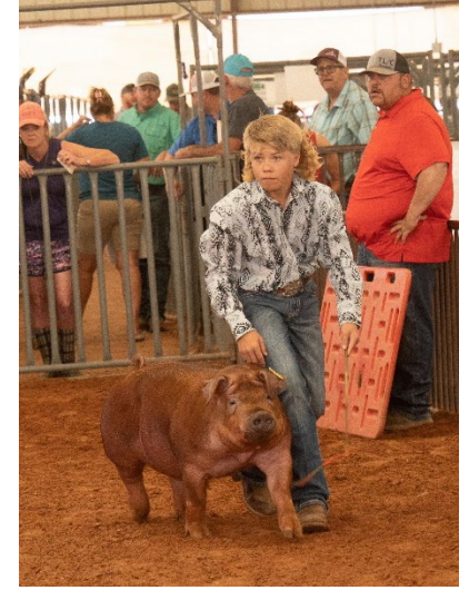
2023 Lea County Fair Junior Livestock Department