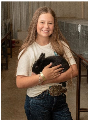
2024 Lea County Fair Junior Livestock Department