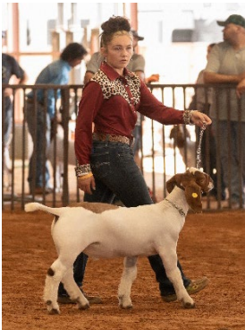
2024 Lea County Fair Junior Livestock Department