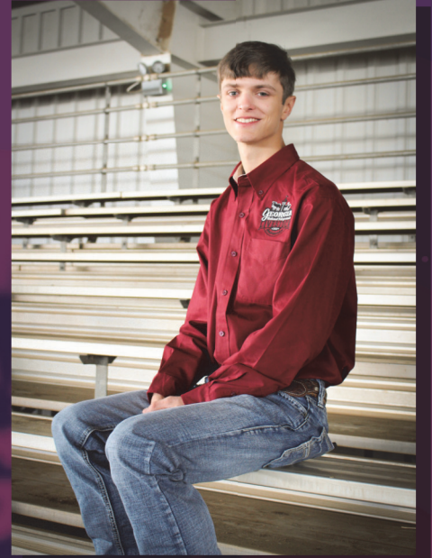
LEYTON MORRIS MORGAN CO. HIGH SCHOOL