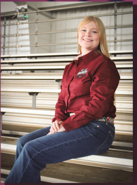
ALY CORZINE VETERANS HIGH SCHOOL