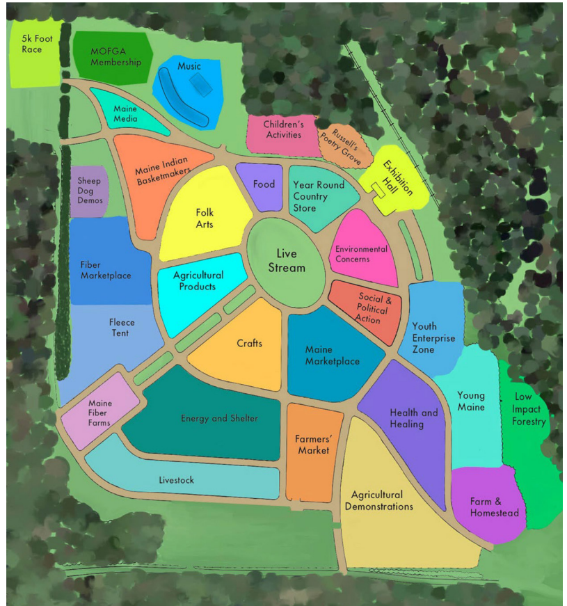
Common Ground offers a map for virtual viewers to use to find areas of interest - still available at www.fair.mofga.org

The Maine Organic Farmers & Gardeners' Common Ground Fair, with headquarters in Unity, Maine, designed, created and presented a Virtual Agricultural Fair on September 25, 26 and 27. "Celebrating Rural Living at Home" was their slogan. Throughout the three days of the fair, music and diverse workshops focusing on organic farming techniques were live streamed. Great news - these workshops continue to be available for viewing on their website at www.fair.mofga.org !