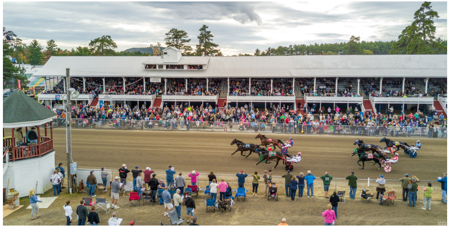
Fryeburg's Virtual Fair continues to be available for viewing on their website www.fryeburgfair.org & Facebook page!