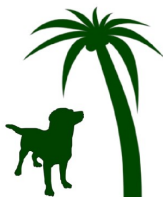
Boca Raton Dog Club