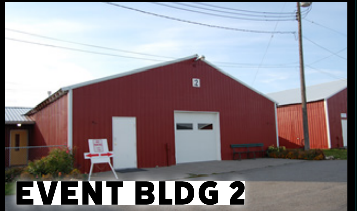
EVENT BLDG 2