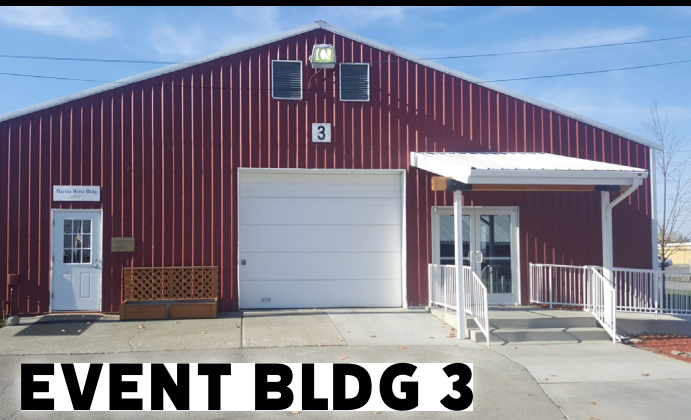
EVENT BLDG 3