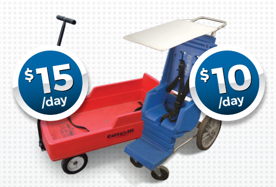
WAGONS & STROLLERS