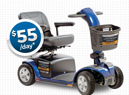
STANDARD 3 OR 4-WHEEL SCOOTER