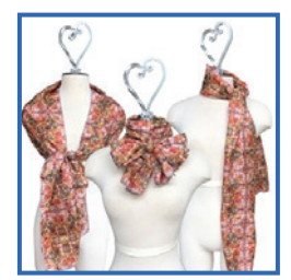
Heather Wasaff Booth 115 The Woodlands, TX Wearable Art