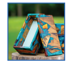
Alisha Pangborn Booth 121 Magnolia, TX Wood