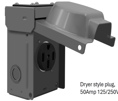
Dryer style plug, #14-50R 50Amp 125/250Volt