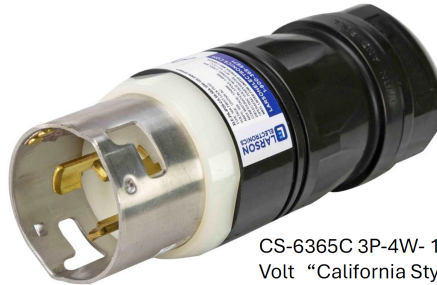
CS-6365C 3P-4W- 125/250 Volt "California Style"