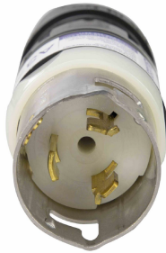
CS-6365C 3P-4W- 125/250 Volt "California Style"