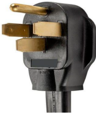
Dryer style plug, #14-50R 50Amp 125/250Volt