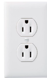
Standard 120Volt 20Amp