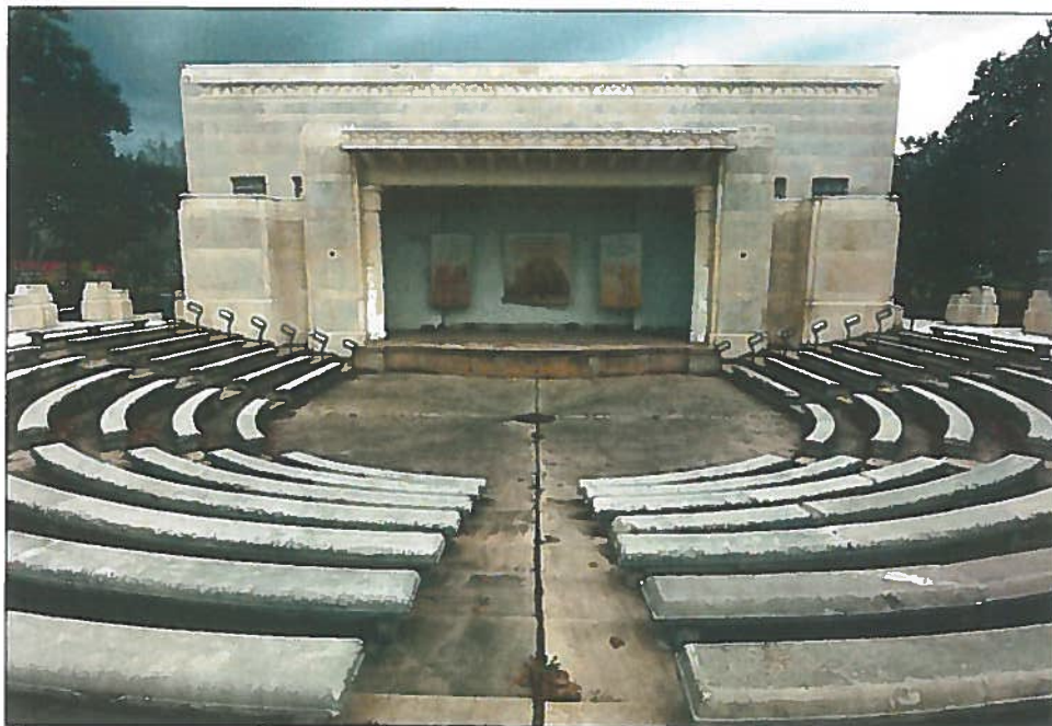
Above: The remarkable amphitheater behind the Gonzales Memorial Museum.

Although the diminutive cannon size (roughly two feet long) may be underwhelming to some visitors, the remainder of the Republic-oriented collection is impressive, along with the shellcrete building and unexpectedly compelling amphitheater built into the back of the structure. ★