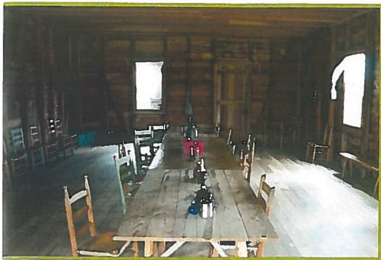
Above: A wooden structure at Washington-on-the-Brazos depicts the site where the Texians signed the Declaration of Independence 180 years ago. Right: A Texas Revolution exhibit at the site's Star of the Republic Museum.