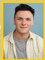
Arnold