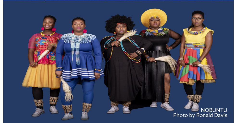
NOBUNTU