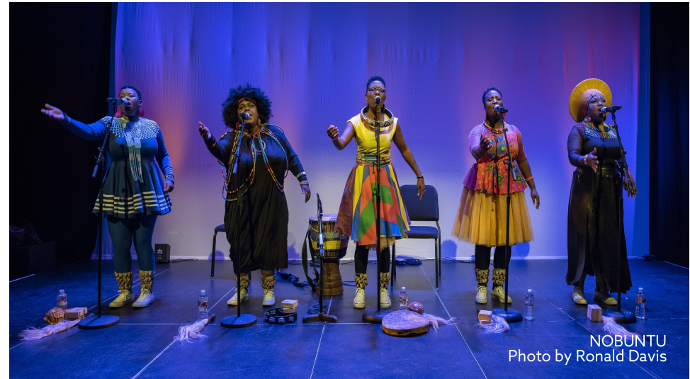
NOBUNTU