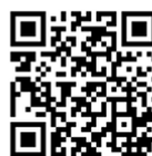
Beef Quality Assurance

For additional information on weaning methods and Beef Quality Assurance, scan the QR codes below: