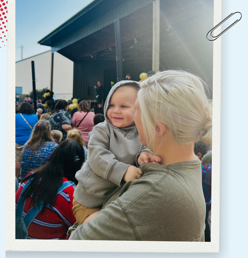
Mother and son dance to the Koo Koo Kangaroo Band on the BandShell Stage.