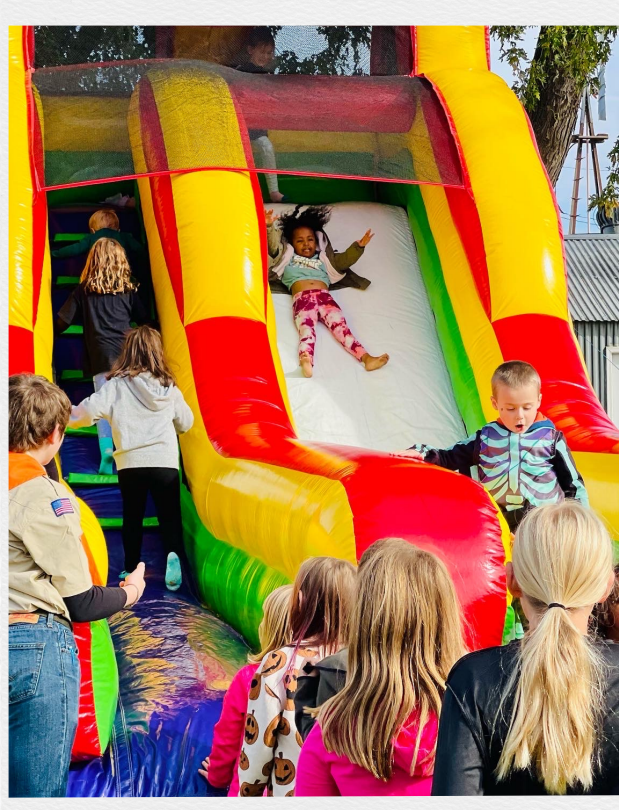
Kids enjoy the blow up rides that were included with admission to the festival.