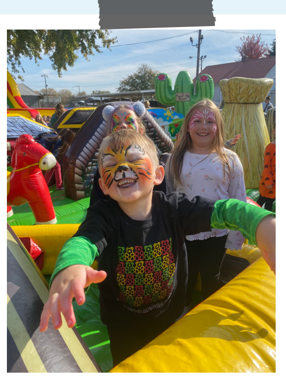
Festive kids giggle during the blow up rides at the festival.