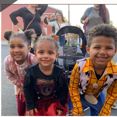
Trick or treat. They are ready for the Trick or Treat Haunted House.

THE FALL FESTIVAL BRAND AND THEME FOR MARKETING WERE THE SAME BRAND FOR THE ANOKA COUNTY FAIR, BUT INSTEAD FOCUSED MORE ON THE RED AND YELLOW THAN THE BLUE AND RED LIKE THE ANOKA COUNTY FAIR.