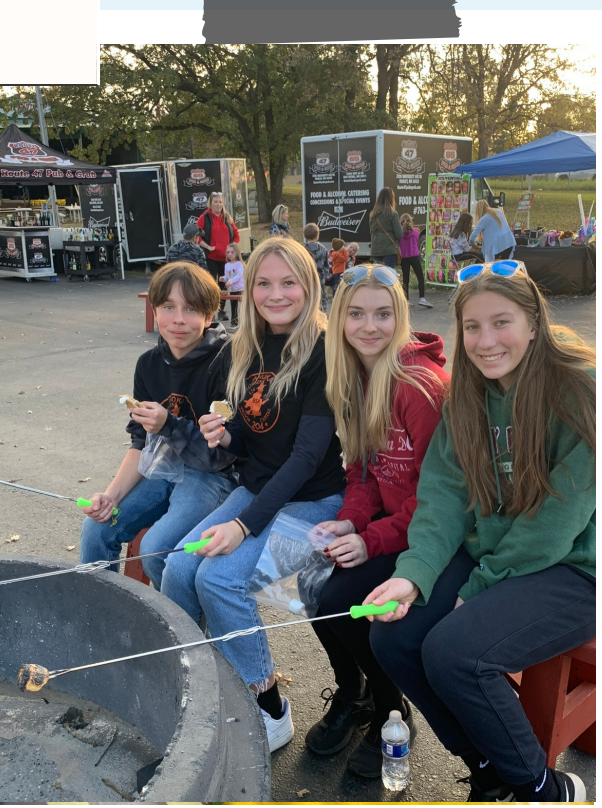
Smores! People roast marshmallows on the fire at the Boy Scout's Booth at the event.