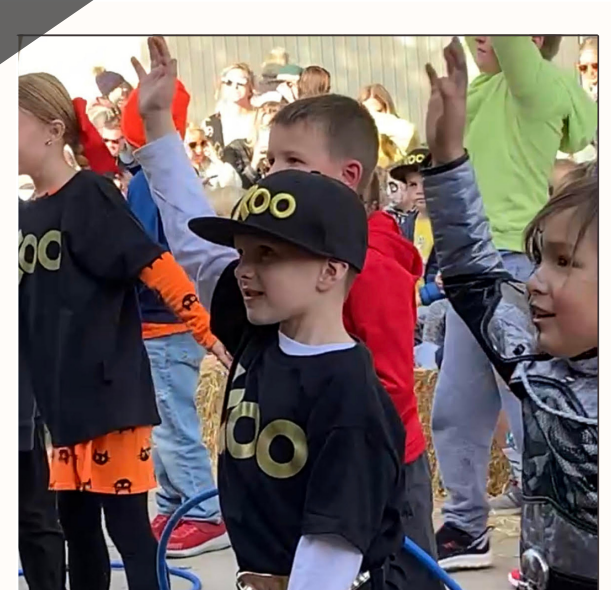
Kids dance to the "Dinosaur Stomp" with Koo Koo Kangaroo at the BandShell Stage.

1a. Successful Non-Fair Event at your Facility produced or co-produced by Facility staff