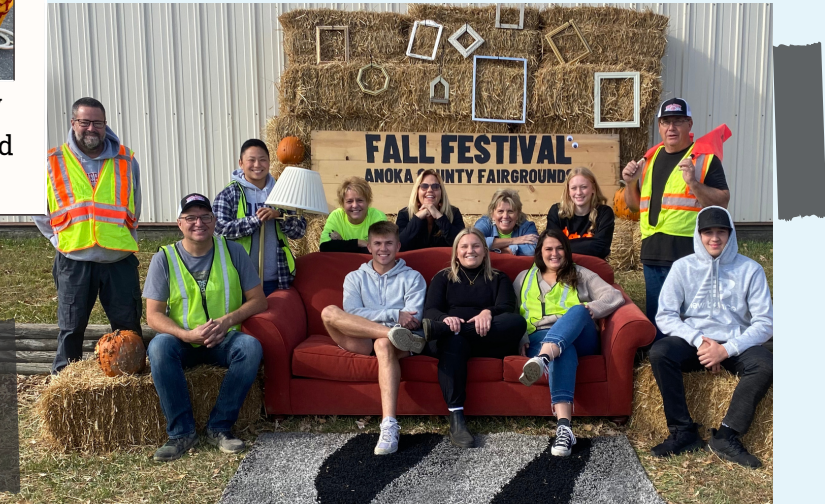
The volunteer staff that helped put on the Fall Festival is pictured at one of the photo opportunity stations at the festival.

THE FALL FESTIVAL BRAND AND THEME FOR MARKETING WERE THE SAME BRAND FOR THE ANOKA COUNTY FAIR, BUT INSTEAD FOCUSED MORE ON THE RED AND YELLOW THAN THE BLUE AND RED LIKE THE ANOKA COUNTY FAIR.