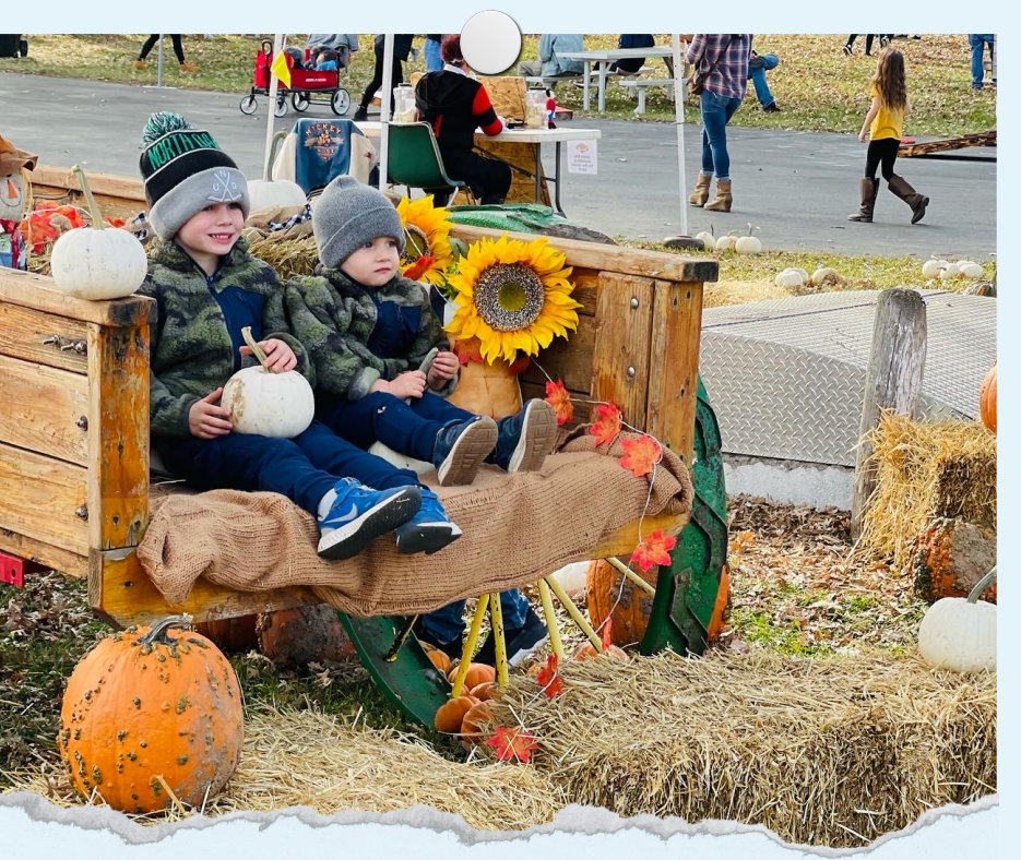
Photo opportunities. Families set up fall photo shoots with their kids.