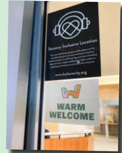
Kulture City and Warm Welcome decals at our entrances highlight our commitment to inclusivity

The Baltimore Convention Center is happy to share an Equity Statement and Objectives of the I.D.E.A. Council (Inclusivity, Diversity, Equity, Accessibility). This Council, created on February 23, 2023, is represented by all organizational departments and leadership levels, and strives to include as many employees and voices as possible. The Council and the programs and ideas that are being created are a priority of the BCC. We are also a member of Visit Baltimore’s Warm Welcome Pledge and stand alongside the entire hospitality industry in Baltimore to foster an inclusive community where visitors of all backgrounds, races, genders, and abilities know and feel that they’re welcome when they come to Charm City.