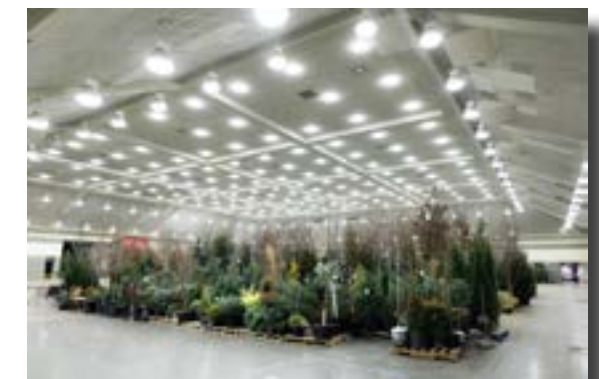
Plants and trees left from MANTS prepared for donation