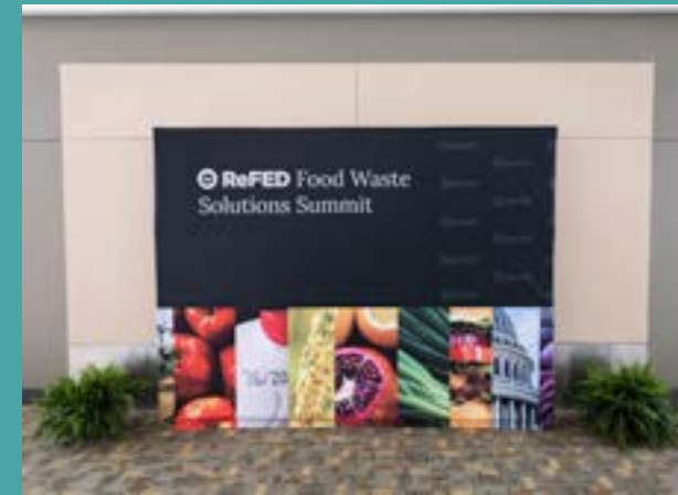
ReFed space setup

The Baltimore Convention Center continues to lead the way in sustainability, proudly hosting the ReFED Food Waste Solutions Summit. In addition to incorporating specific sustainability initiatives into their event, the BCC was invited to host a sustainability tour as part of the official event program. With over 30 engaged attendees, the tour sparked such interest that it ran more than twice its scheduled time!