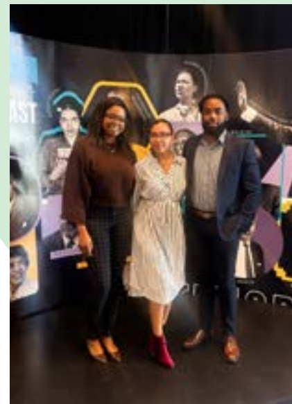
Members of the I.D.E.A. Council attending the 2024 Civil Rights Breakfast

As our commitment to sustainability grows, we are in a position to re-evaluate regularly what sustainability means to the BCC and in our industry. Sustainability focuses on preserving future generations and quality of life. This includes environmental components, economic components, and social responsibility.