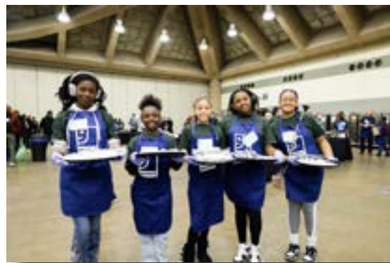
Young volunteers serving at Goodwill's Thanksgiving Dinner

Through these efforts, the BCC continues to reinforce our role as a hub for community support and sustainability during the holiday season.