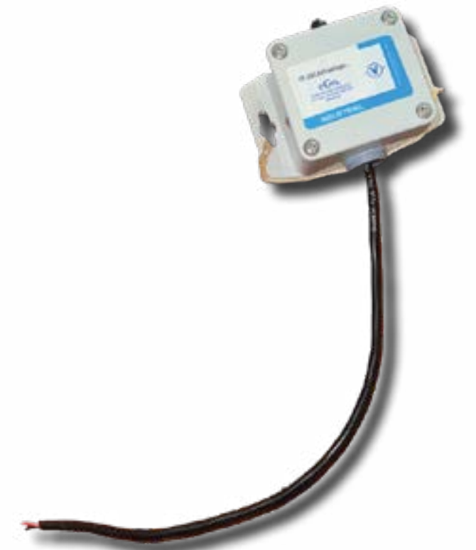
Electrical Power Meter and Reporting Device

Implementing this system requires extensive hands-on work to install sensors for accurate data collection. The cloud-based platform will enable us to analyze power usage in real time, allowing us to provide clients with detailed insights into the energy and water consumption of their events. SkySpark sensors are currently being installed throughout the facility, and in 2025, we will officially begin reporting our data findings.