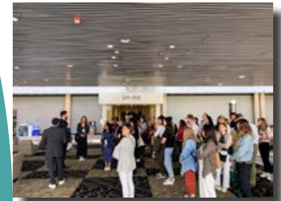
BCC sustainability tour