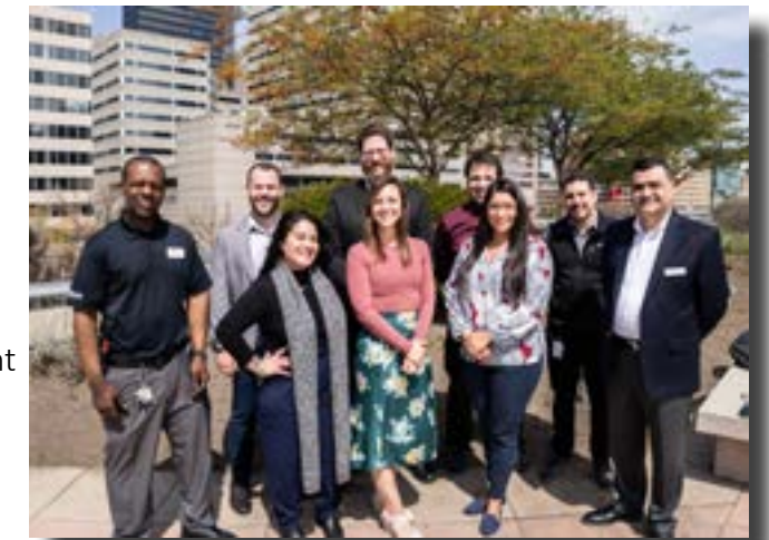
The BCC's Green Team

Meet the 2024 Baltimore Convention Centers Green Team Council, bringing together dedicated employees from every department to advance sustainability initiatives and Corporate Social Responsibility efforts. Throughout the year, the council met regularly to discuss the facility's sustainable features, existing environmental and community programs, and educational opportunities. Their efforts also aimed to meet the criteria for Events Industry Council Sustainable Event Standards certification.