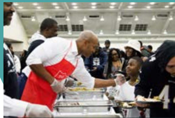
Governor Wes Moore volunteering at 53 Families Foundation's Thanksgiving Dinner