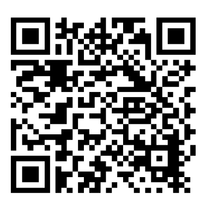
Let's get social