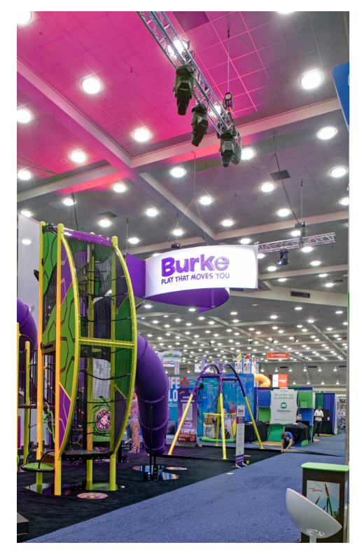
NRPA September 24-26, 2019 at the Baltimore Convention Center