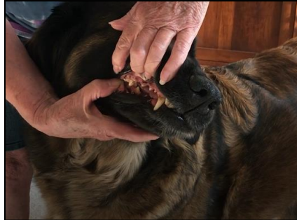
Showing the Teeth (include 2 photos)