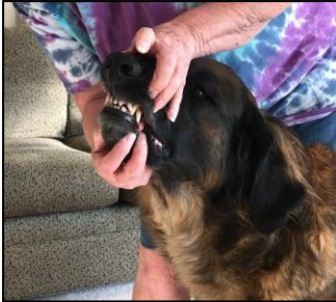
Showing the Bite