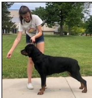
Example 1 – Side View