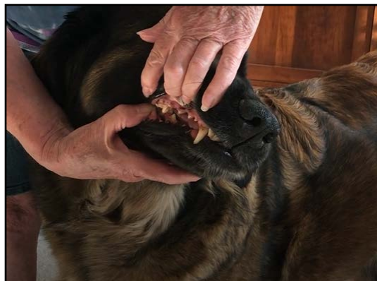
Showing the Teeth (include 2 photos)