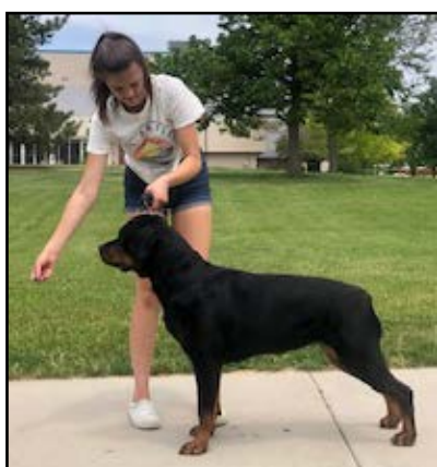
Example 1 – Side View