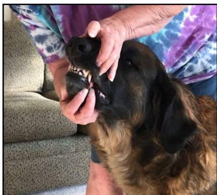
Showing the Bite