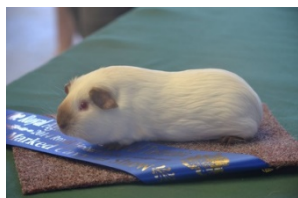
Left side photo