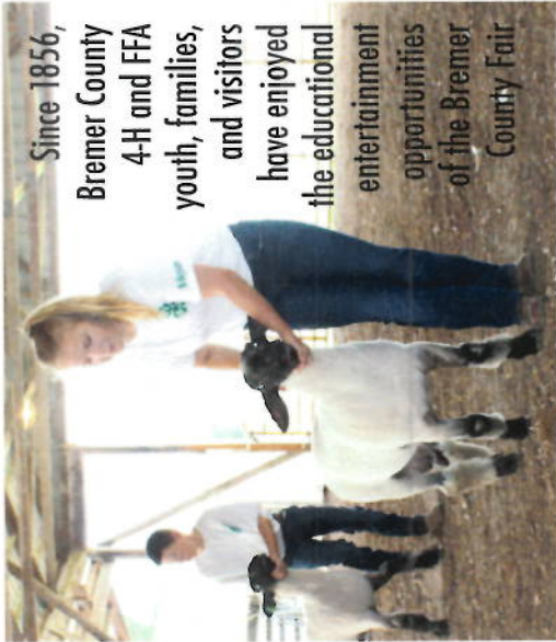
Since 1856, Bremer County 4-H and FFA youth, families, and visitors have enjoyed the educational entertainment opportunities of the Bremer County Fair