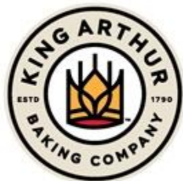
King Arthur Baking Company