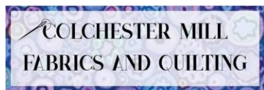
Colchester Mill Fabrics & Quilting