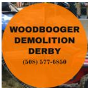
Woodbooger Demolition Derby WoodboogerDemolitionDerby.com