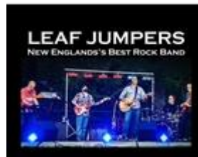
Leaf Jumpers Band www.leafjumpers.com