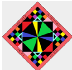
Greater Middletown Quilt Guild