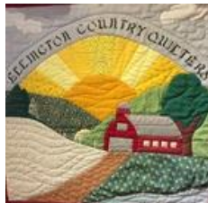
Ellington Country Quilters