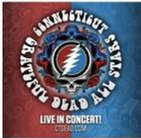
CT Grateful Dead All-Stars www.CTDead.com