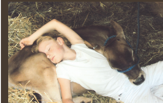
After The Show • Bridgewater Country Fair