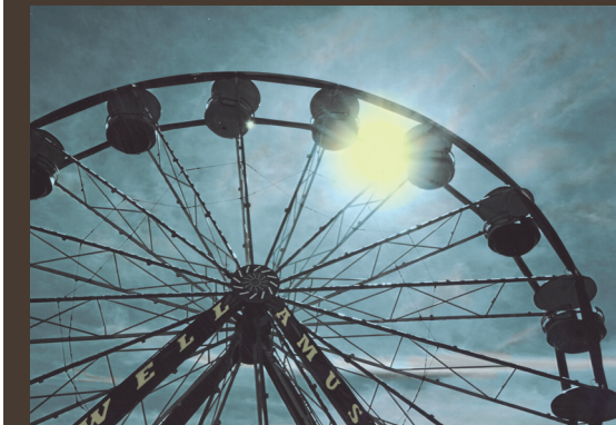
Kissing the Sun • Durham Fair