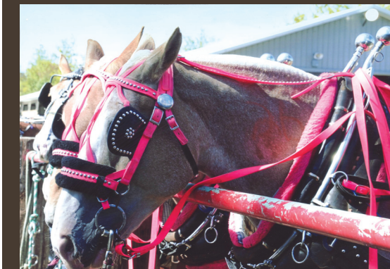
Pretty In Pink • Durham Fair