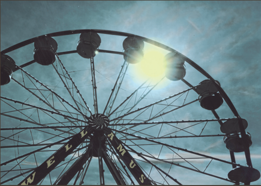
Kissing the Sun • Durham Fair