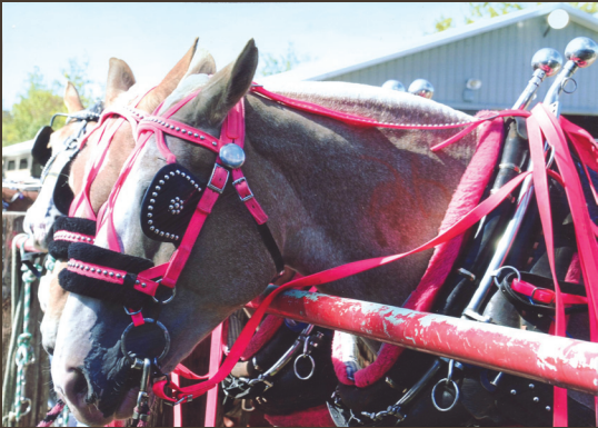
Pretty In Pink • Durham Fair