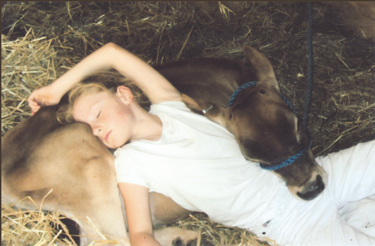
After The Show • Bridgewater Country Fair