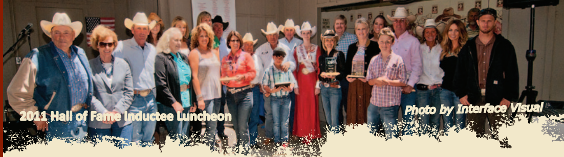
2011 Hall of Fame Inductee Luncheon