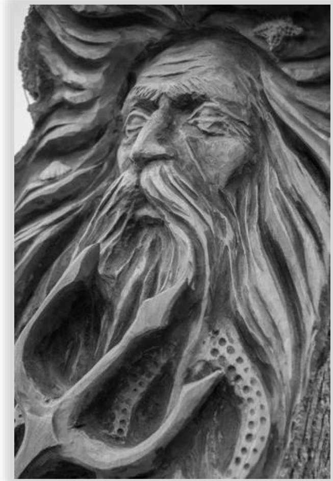
Class 8: Flowers

1812.Realistic -painted 1813.Realistic-natural 1814.Stylized-painted 1815.Stylized-natural