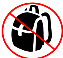
BACKPACK OF ANY KIND