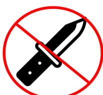
KNIVES OF ANY KIND