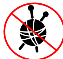
KNITTING NEEDLES OR CROCHET HOOK