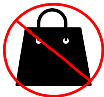
LARGE PURSE OR BAG