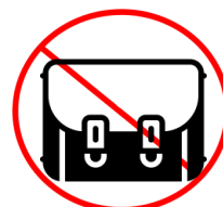
CAMERA CASES OR BAGS