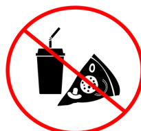
OUTSIDE FOOD OR DRINK