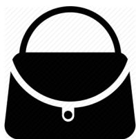
SMALL PURSE OR CLUTCH