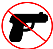
GUNS OR WEAPONS OF ANY KIND