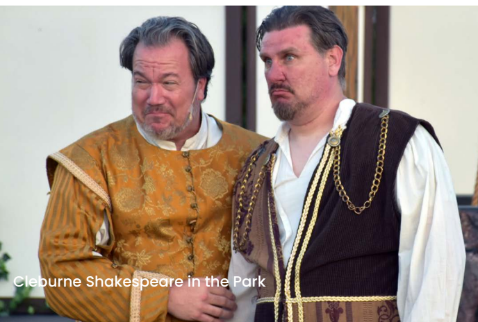
Cleburne Shakespeare in the Park

The Cleburne Chamber of Commerce and Plaza Theatre Company are pleased to announce "Cleburne's Shakespeare in the Park". The event will take place at Winston Patrick McGregor Park with one performance on Friday & Saturday beginning at dusk each evening. Bring your lawn chairs and enjoy a great performance written by William Shakespeare. 817-645-2455 www.cleburneshakes.com