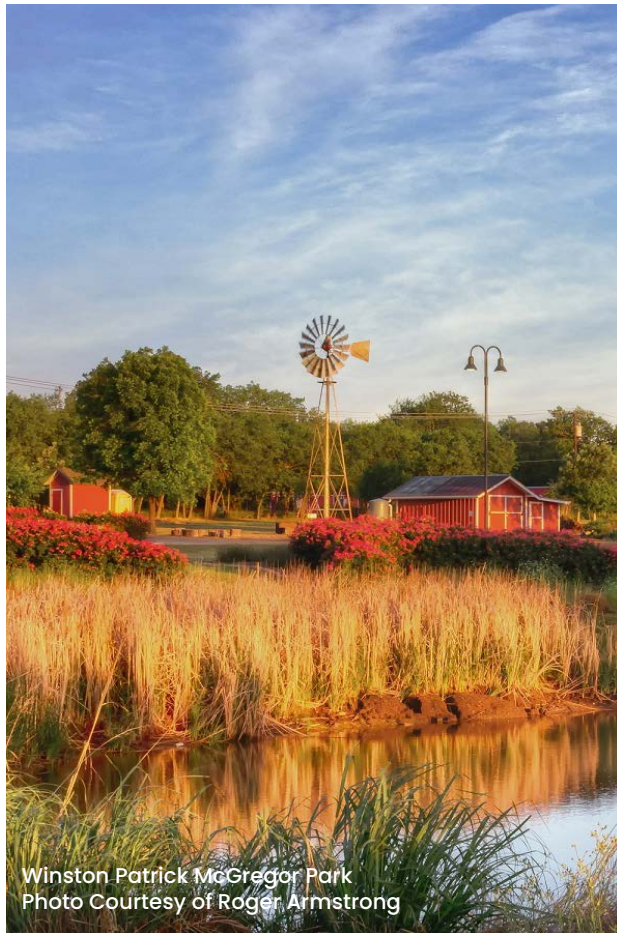
Winston Patrick McGregor Park

1628 W. Henderson St. 817-556-8858 www.cleburne.net