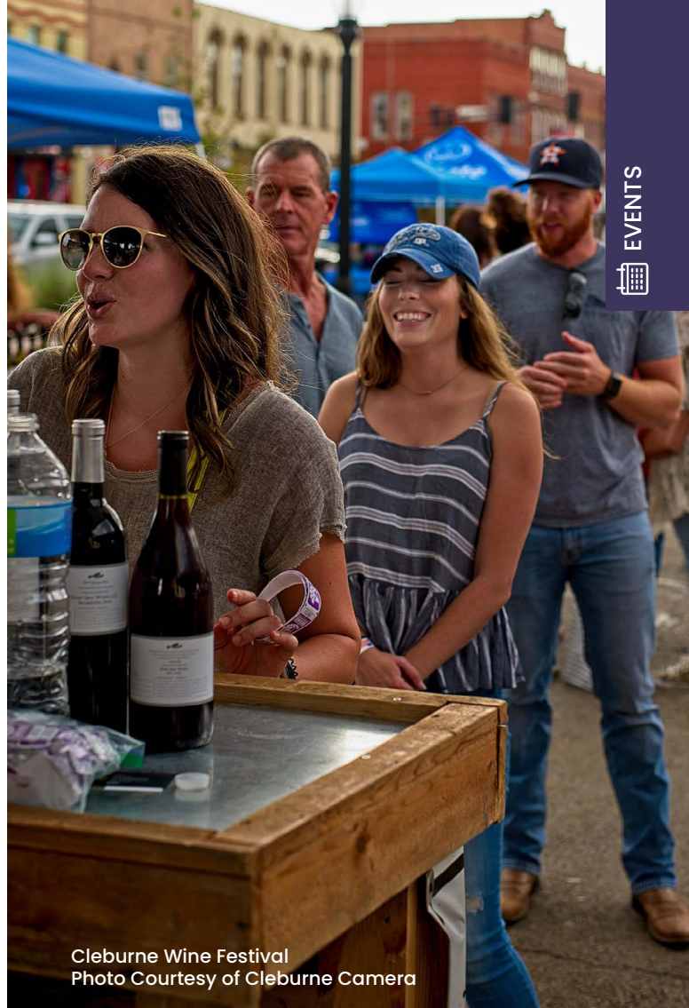
Cleburne Wine Festival

The annual event, is held the first Saturday in December in Downtown Cleburne, features historical homes, museums, entertainment & more throughout the day. 817-645-0940 www.visitcleburne.com