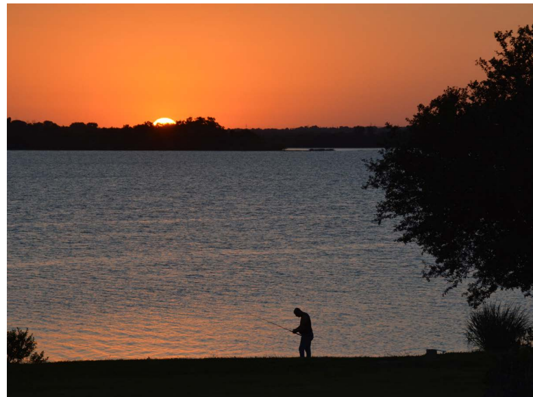
Lake Pat Cleburne

BRAZOS CHAMBER ORCHESTRA brings the symphony to Cleburne with an eclectic blend of orchestral music, including Classical, Big Band, Movie Tunes, Americana and Pop. The 50-piece orchestra holds concerts during the spring, fall and winter.