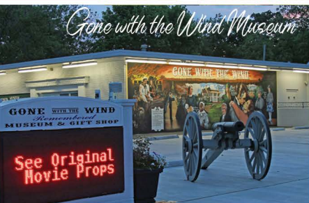
Gene with the Wind Museum