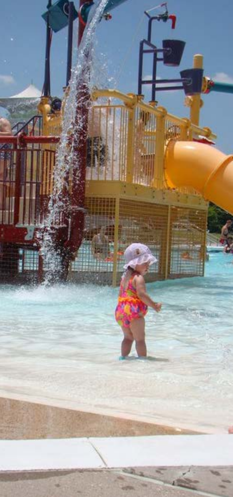
Splash Station