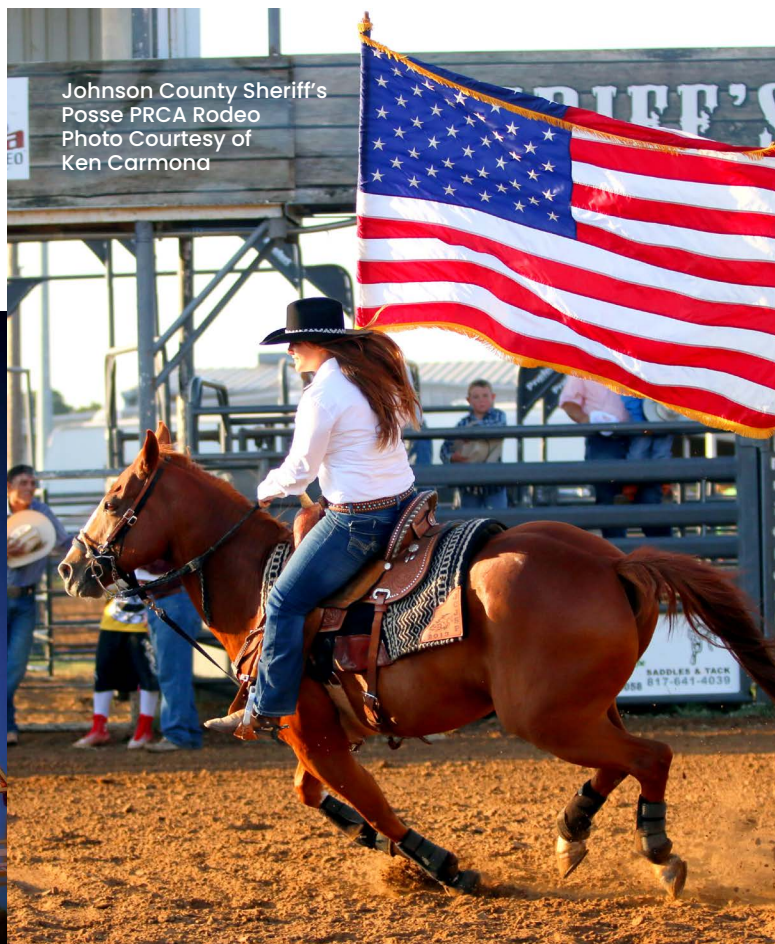
Johnson County Sheriff's Posse PRCA Rodeo