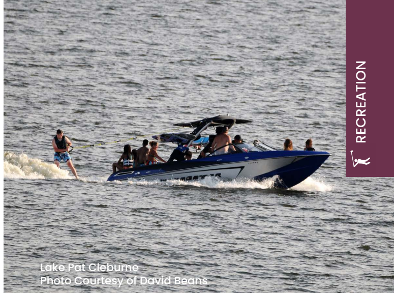
Lake Pat Cleburne