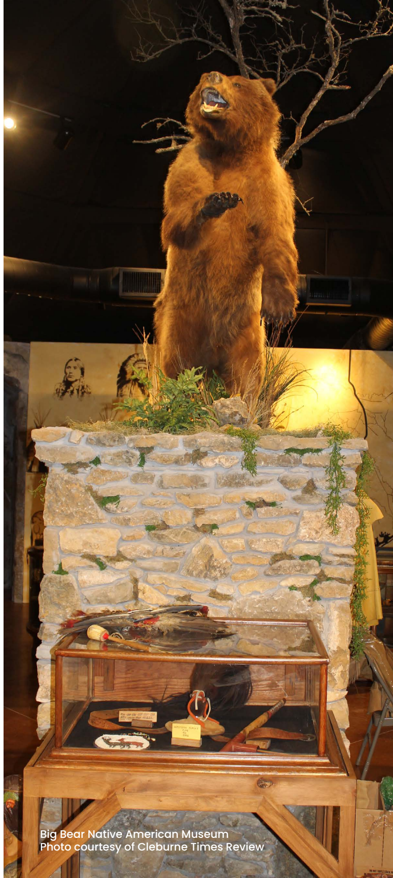
Big Bear Native American Museum

THE GONE WITH THE WIND REMEMBERED museum contains one of the most comprehensive and extensive GWTW collections. The museum houses not only the typical auction house memorabilia, but also a number of one-of-a-kind and extremely rare pieces not found in other collections. More than 6,000 historical pieces are showcased. The museum is open Thursday through Saturday from 10:00 am to 5:00 pm.