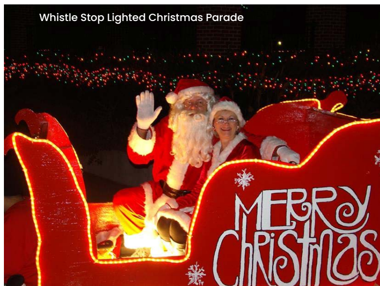
Whistle Stop Lighted Christmas Parade