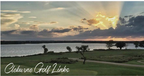
Cleburne Golf Links