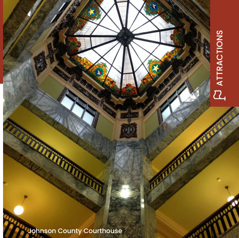
Johnson County Courthouse