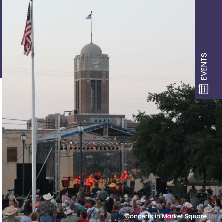
Concerts in Market Square