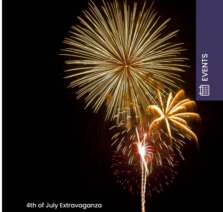
4th of July Extravaganza