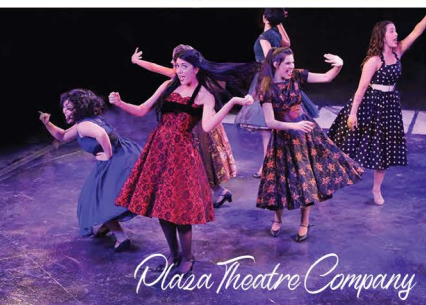
Plaza Theatre Company